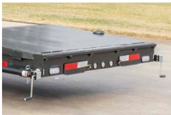
Tubing Rear Bumper for Light Protection