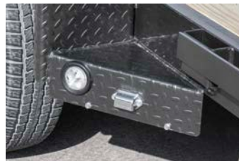
Fender Steps for Easy Bed Access