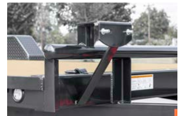
Spare Tire Mount