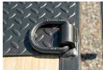
4 Bull-Nose 5/8" D-Rings to Secure Loads